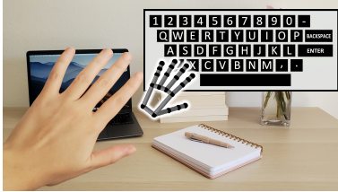
(a) Default Setup. Increasing the FoV.