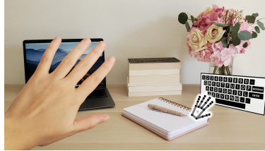
(b) Flexible Setup. Maximizing the FoV.