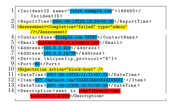
Figure 1: Annotated private, sensitive, and confidential information (inference) information in IODEF.

In this example, the Code Red worm attempted to target the HTTP port for a host with an IP address of 192.0.2.200 . The raw HTTP request sent by the worm is captured in the report. The worm intended to fiddle with the web server and the request was presumably an attempt for a buffer overflow attack in order to